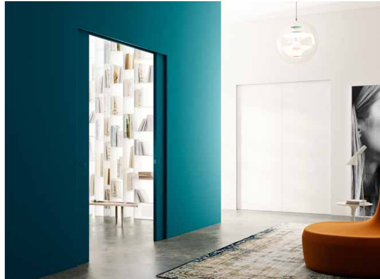
MAREA | POCKET DOOR | Two leaves version | Wallpaper coating

Behind our work there's a hidden Italian story of experience and exclusive design. The precise technical know-how is masked by the apparent simplicity of the flush-to-wall door that, combined with a maximum level of "customization", allows fulfilling the most demanding aesthetic desires and functional expectations.