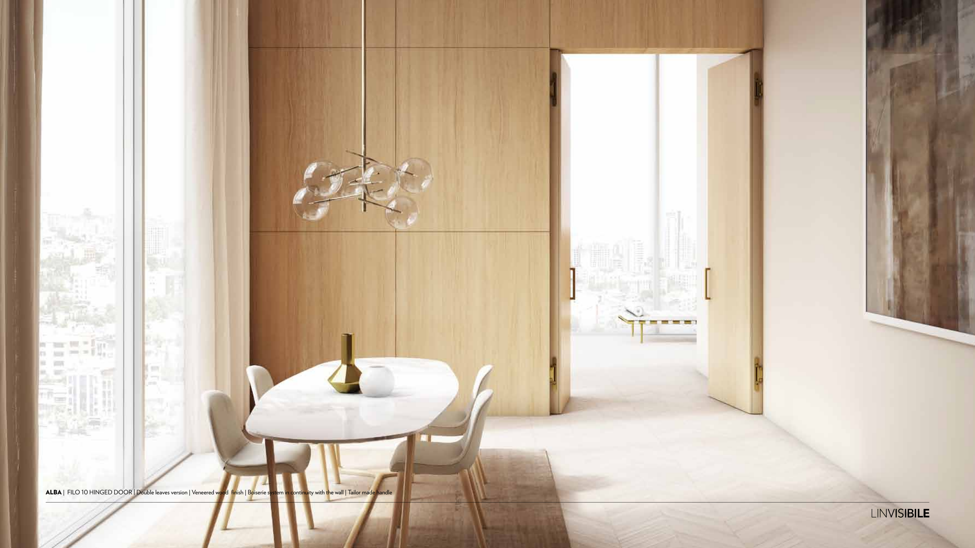
ALBA | FILO 10 HINGED DOOR | Double leaves version | Veneered wood finish | Boiserie system in continuity with the wall | Tailor made handle