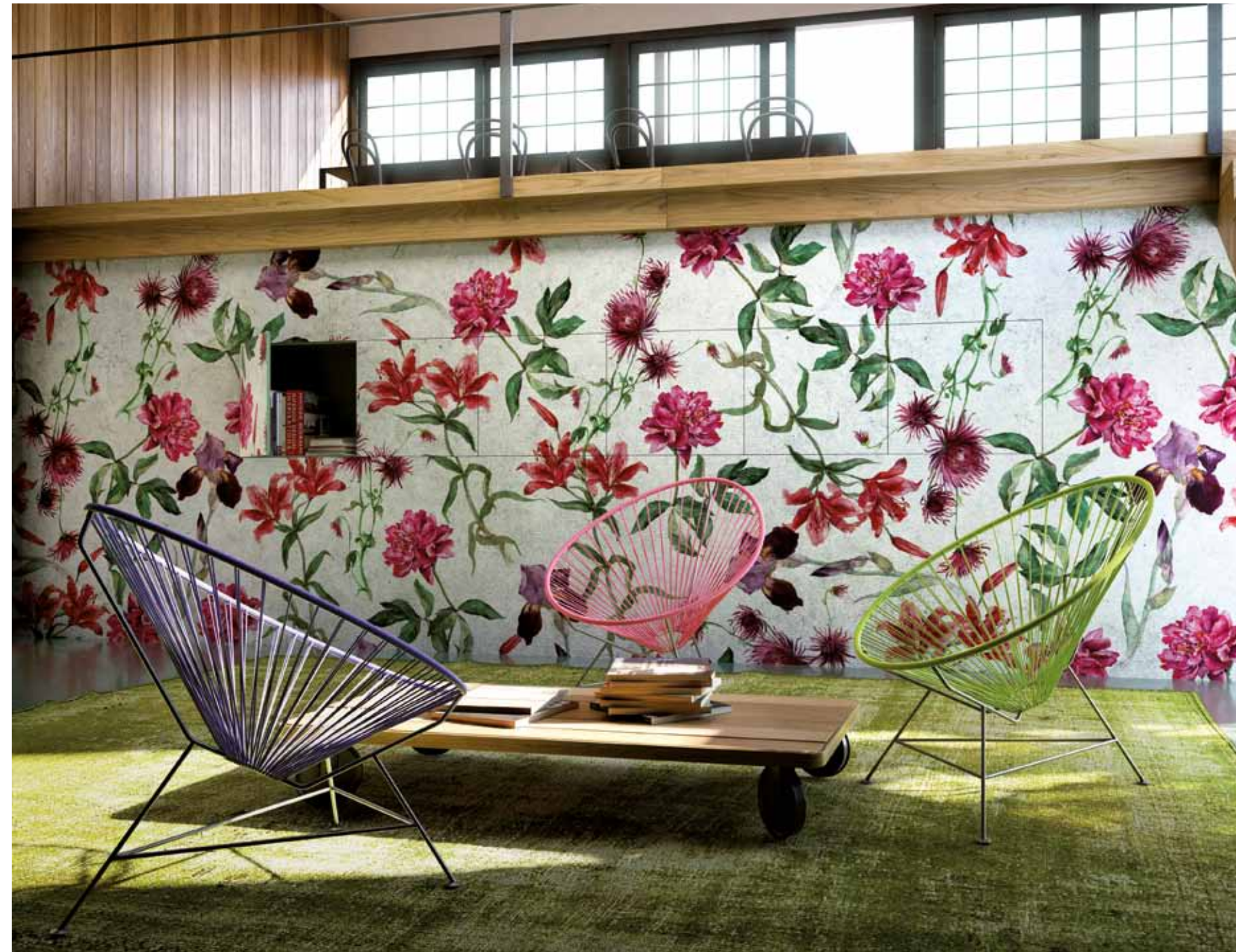
TECHNICAL CLOSURES | Nicchio multileaves flanked | Push-pull lock | Wallpaper coating

100% Made in Italy products with high quality and exceptional results, we offer an exclusive 10-year warranty on our aluminium frames and a 2-year warranty for all our panels.