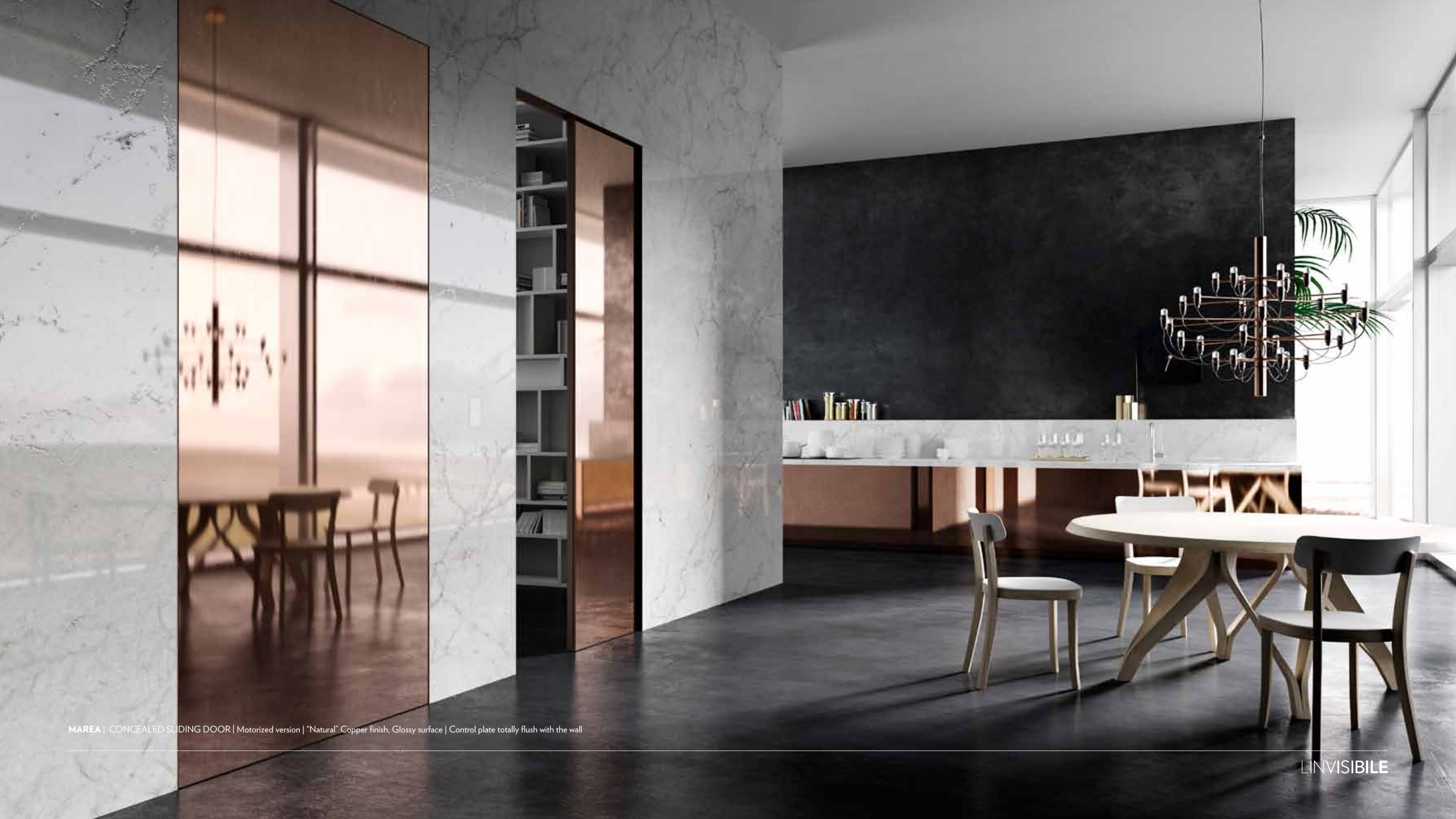
MAREA | CONCEALED SLIDING DOOR | Motorized version | "Natural" Copper finish, Glossy surface | Control plate totally flush with the wall