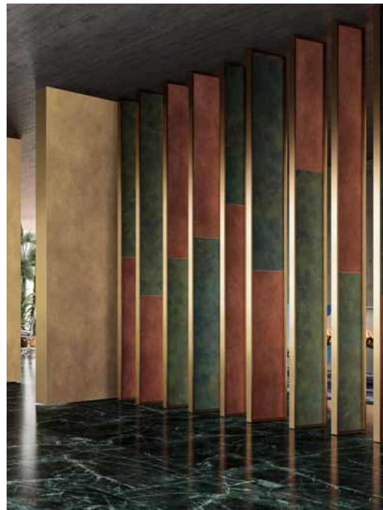
BREZZA | ZEFIRO SYSTEM | Framed version Frame finish light bronze anodized aluminium | Panel finishes: metal and leather

Our widespread and well-organized network of specialized teams of installers is available countrywide; their experience and professionalism are at your service to guarantee that our products are aesthetically pleasing, functional and highly durable.