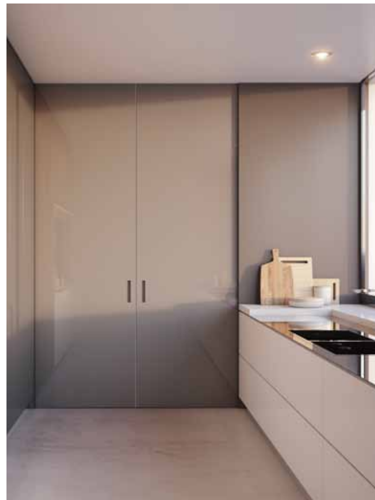
MAREA | POCKET DOOR | Double leaves version | Glossy lacquered finish | Recessed handle

Our widespread and well-organized network of specialized teams of installers is available countrywide; their experience and professionalism are at your service to guarantee that our products are aesthetically pleasing, functional and highly durable.