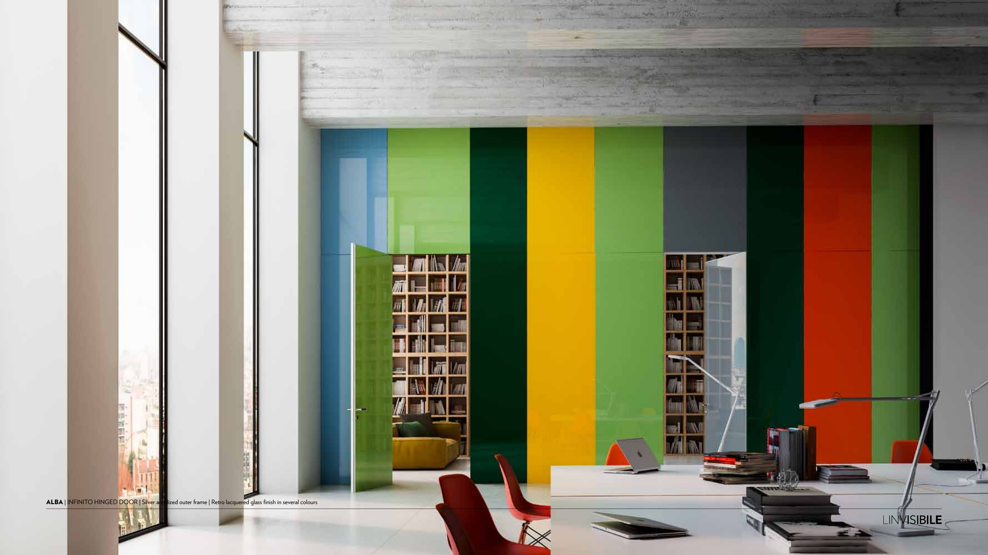
ALBA | INFINITO HINGED DOOR | Silver anodized outer frame | Retro lacquered glass finish in several colours