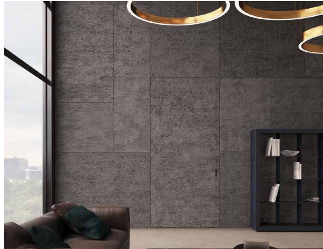
MAREA | CONCEALED SLIDING DOOR | Manual version | Natural stone finish | Boiserie system in continuity with the wall

Behind our work there's a hidden Italian story of experience and exclusive design. The precise technical know-how is masked by the apparent simplicity of the flush-to-wall door that, combined with a maximum level of "customization", allows fulfilling the most demanding aesthetic desires and functional expectations.