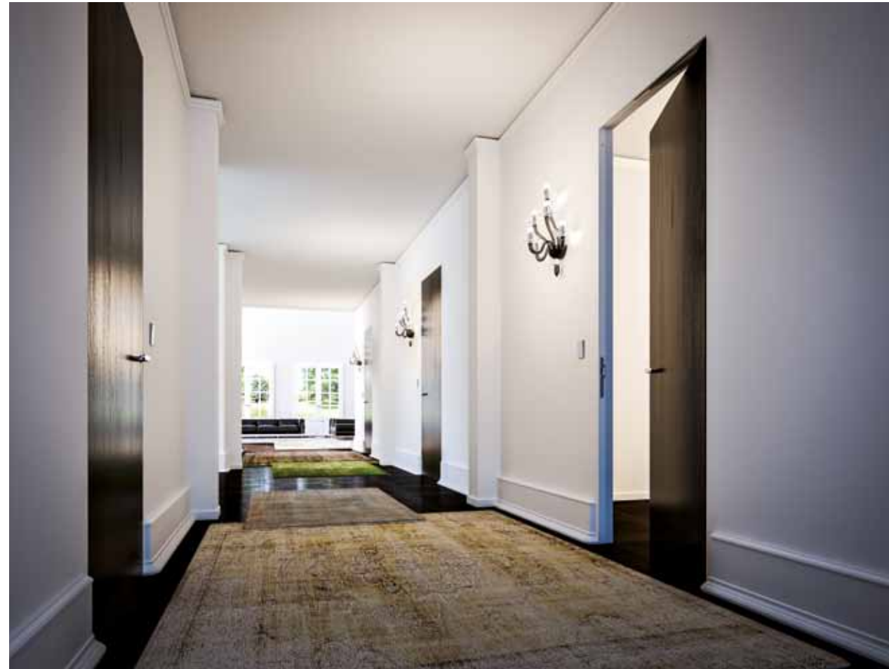
ALBA | HINGED DOOR | Fire resistant REi 30 | EI 30 version | Oak veneered finish | Concealed door closer | Electrical safety lock

Behind our work there's a hidden Italian story of experience and exclusive design. The precise technical know-how is masked by the apparent simplicity of the flush-to-wall door that, combined with a maximum level of "customization", allows fulfilling the most demanding aesthetic desires and functional expectations.