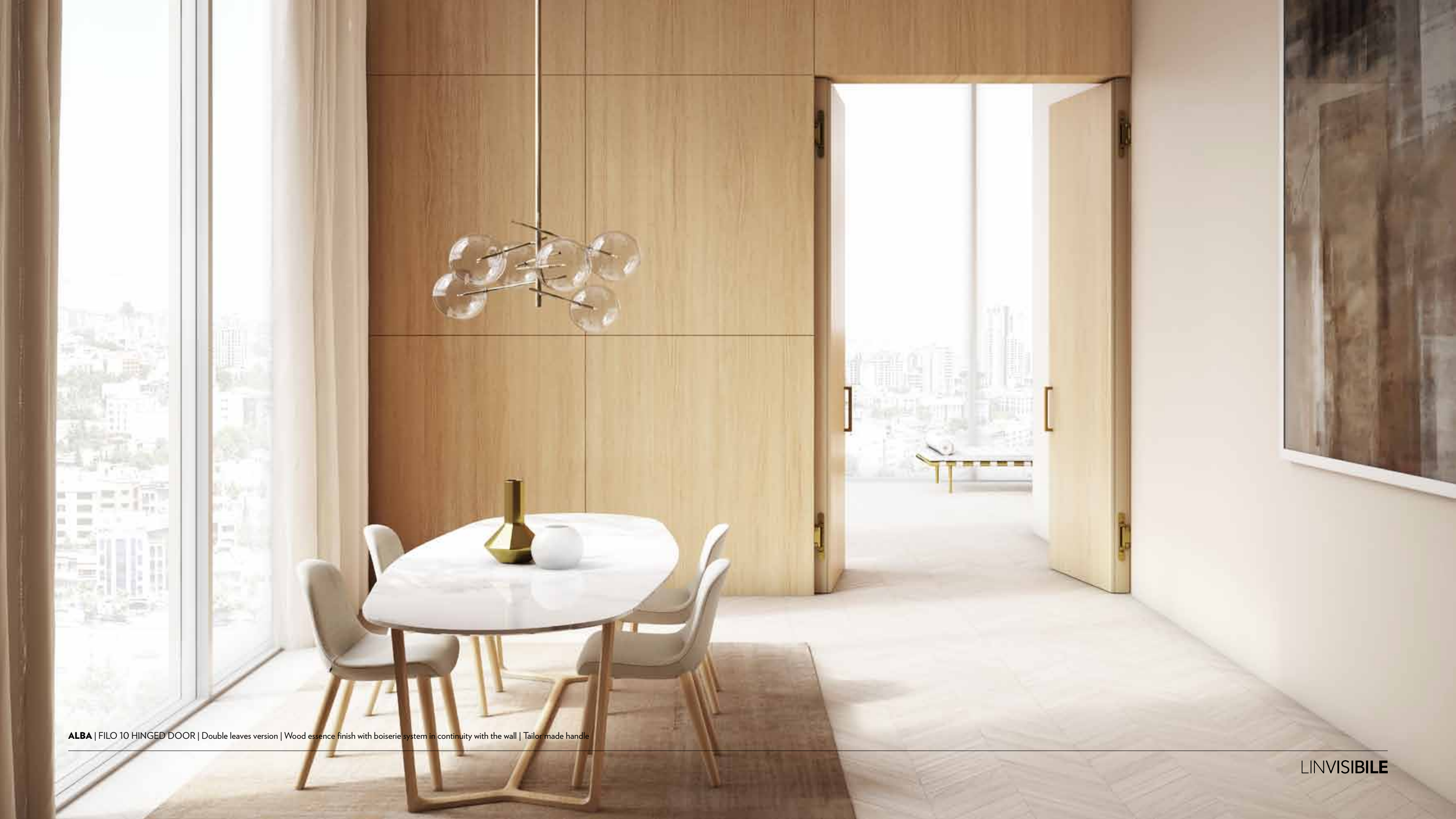
ALBA | FILO 10 HINGED DOOR | Double leaves version | Wood essence finish with boiserie system in continuity with the wall | Tailor-made handle