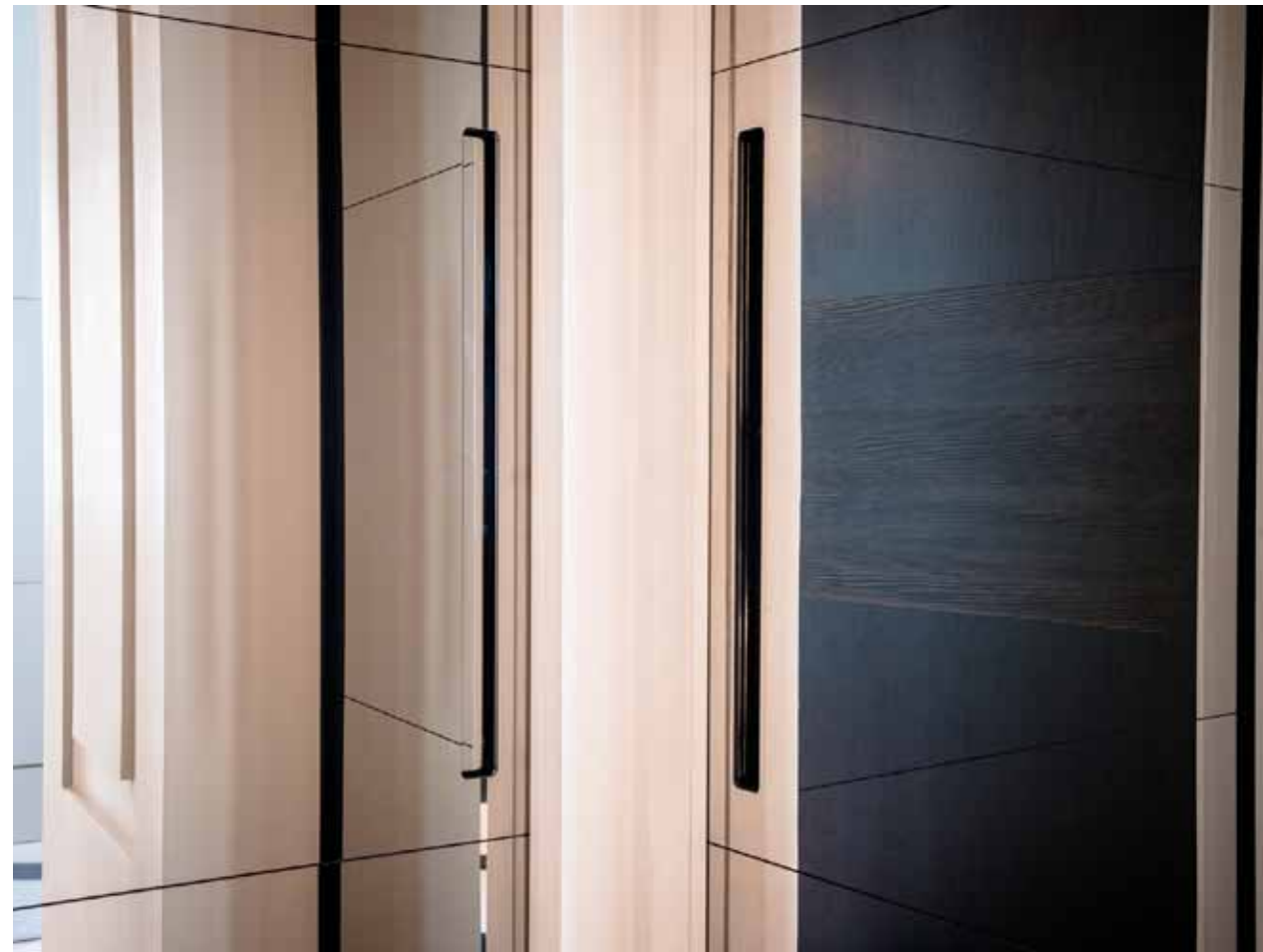
MAREA | POCKET DOOR | Recessed handle | MiraStar® Glass (Saint-Gobain) coating

Behind our work there's a hidden Italian story of experience and exclusive design. The precise technical know-how is masked by the apparent simplicity of the flush-to-wall door that, combined with a maximum level of "customization", allows fulfilling the most demanding aesthetic desires and functional expectations.