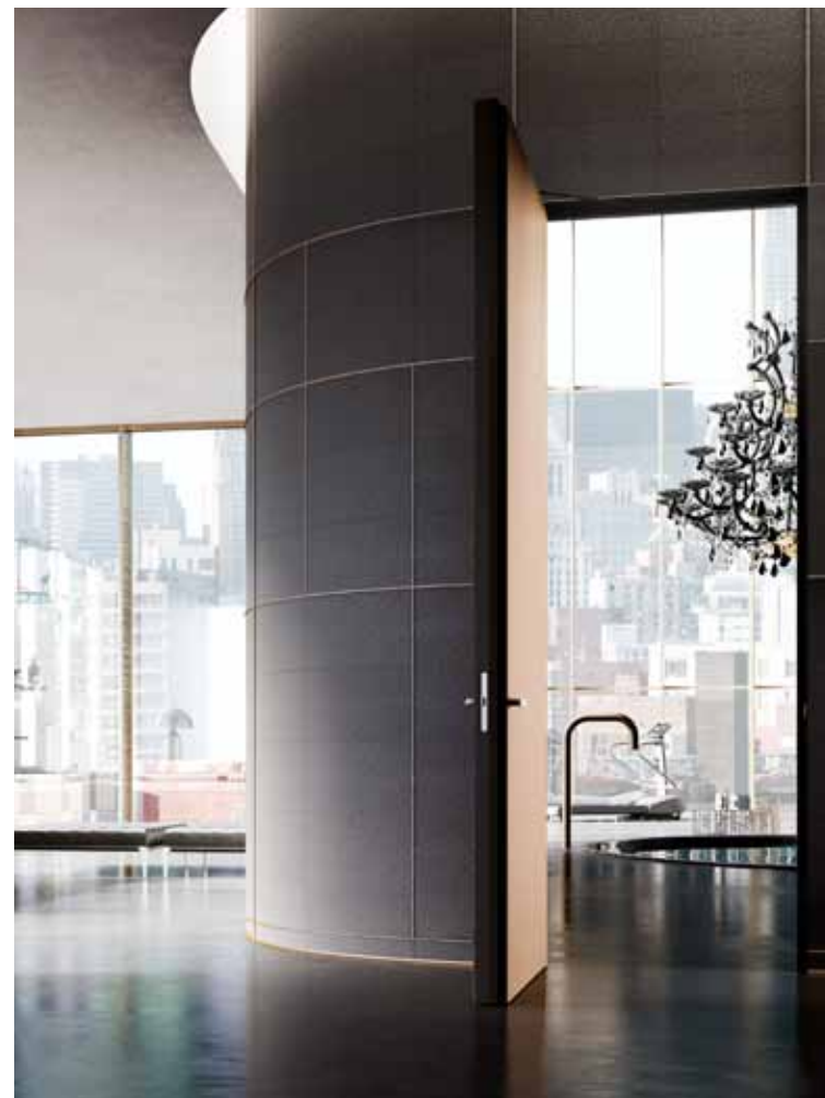
ORIZZONTE | Black shark leather finish Boiserie and skirting systems in continuity with the wall

Our widespread and well-organized network of specialized teams of installers is available countrywide; their experience and professionalism are at your service to guarantee that our products are aesthetically pleasing, functional and highly durable.